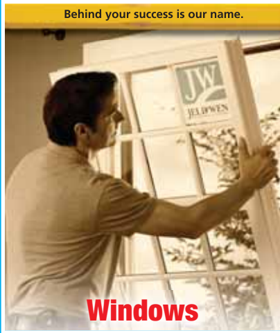
Behind your success is our name.

*Buy 1 window get the 2 nd window of equal or lesser value at 1/2 price. *Top 500 Qualified Remodeler Award 2011